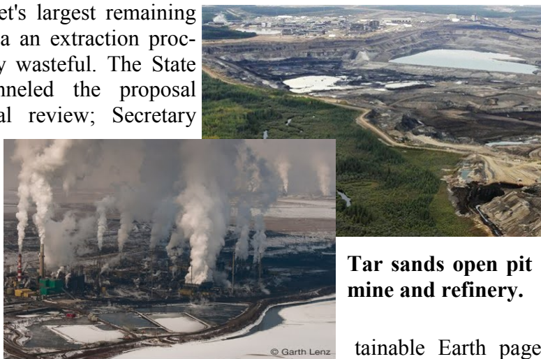
Tar Sand, Suncor upgrader March 2010