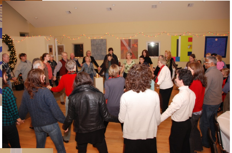
Our service included an Eastern European folk dance.