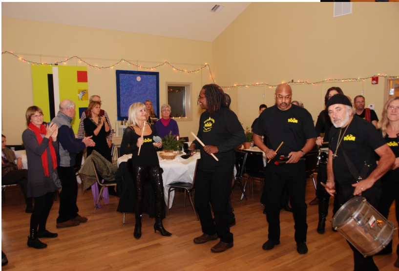
Escola de Samba Boom entertained us with their spirited Brazilian drumming after the service.