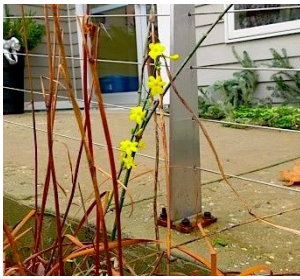
Our winter forsythia.